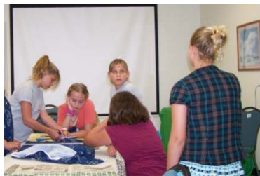
How many 4-H'ers does it take to cut out a pattern?