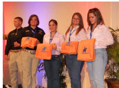
The girls receiving their awards!!