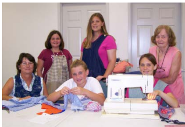
A few members of the sewing group, with their fearless leader!!